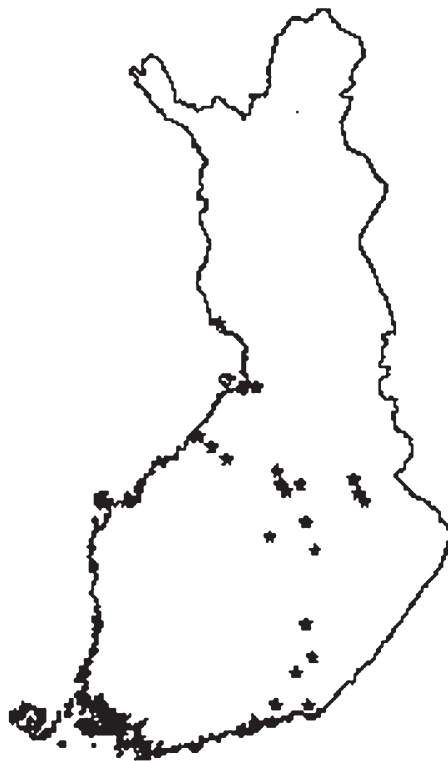
Figure 1. A map of Finland showing the regional distribution of member pig herds of cooperative slaughterhouse Lihakunta which were shown to be infected with Mycoplasma hyopneumoniae (marked with stars).

One owner of a herd infected with M. hyopneumoniae refused to eradicate the infection and resigned the membership. One herd finished pig production and another one changed the production type from integrated to fattening (Table 1). In the remaining herds, an eradication programme was effectuated according to the timetable shown in Table 1. Antibodies to M. hyopneumoniae have not been detected in any of the follow-up samples (n=284) taken in the herds after the completion of the eradication programmes (Table 1). Nor have any clinical or pathological findings indicated failures of the