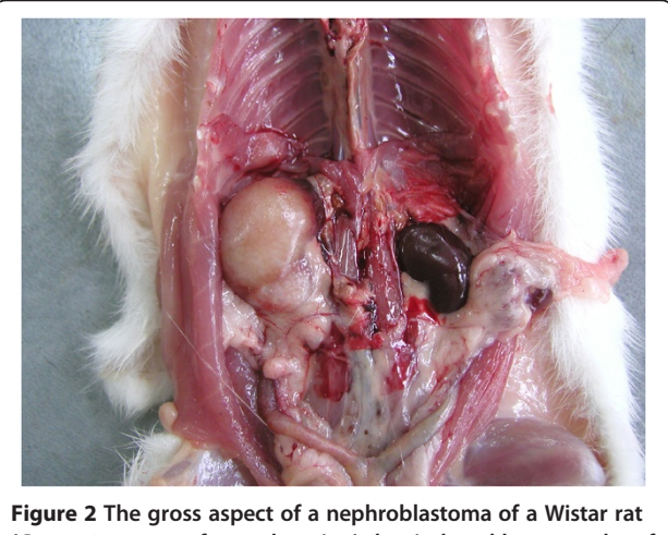
Figure 2 The gross aspect of a nephroblastoma of a Wistar rat (Group 2; see text for explanation) that induced hypertrophy of the right kidney.

using the commercial kits Ransel and Ransod, respectively (Randox Laboratories Ltd., Crumlin, UK) according to the manufacturer's instructions. In both cases, a semiautomatic analyzer MasterPlus Screen (Hospitex Diagnostics, Florence, Italy) was used.