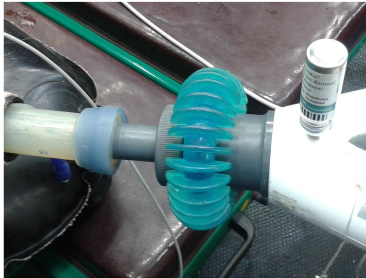
Figure 1 Inhalation of salbutamol. Salbutamol spray canister inserted into the adapter of the Y connection of the circle system during general anesthesia.

salbutamol administration revealed no improvement of \text{PaO}_2 (14.26 kPa = 107 mmHg) and moderate hypercapnia was confirmed, therefore mechanical ventilation was started. The horse recovered assisted uneventfully.