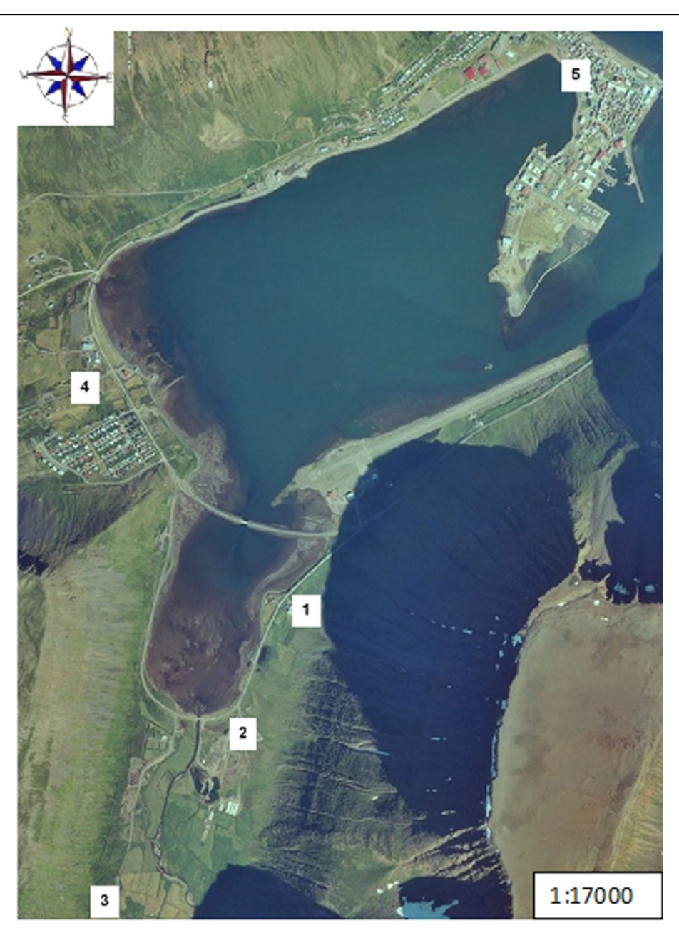
Figure 2 Aerial photograph of Skutulsfjörður. The numbers give the location of the (1) waste incinerator, (2) nearby sheep farm in Engidalur, (3) nearby dairy farm in Engidalur; and (4,5) local town of Ísafjörður.

As the dairy herd was localized at the farm and fed on hay from the valley, one additional composite milk sample and