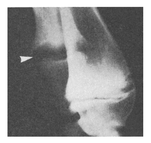
Figure 2. Radiograph showing thickened distal epiphyseal plate of left ulna (arrow) at the termination of overloading. Pig no. 101, 50 kg.