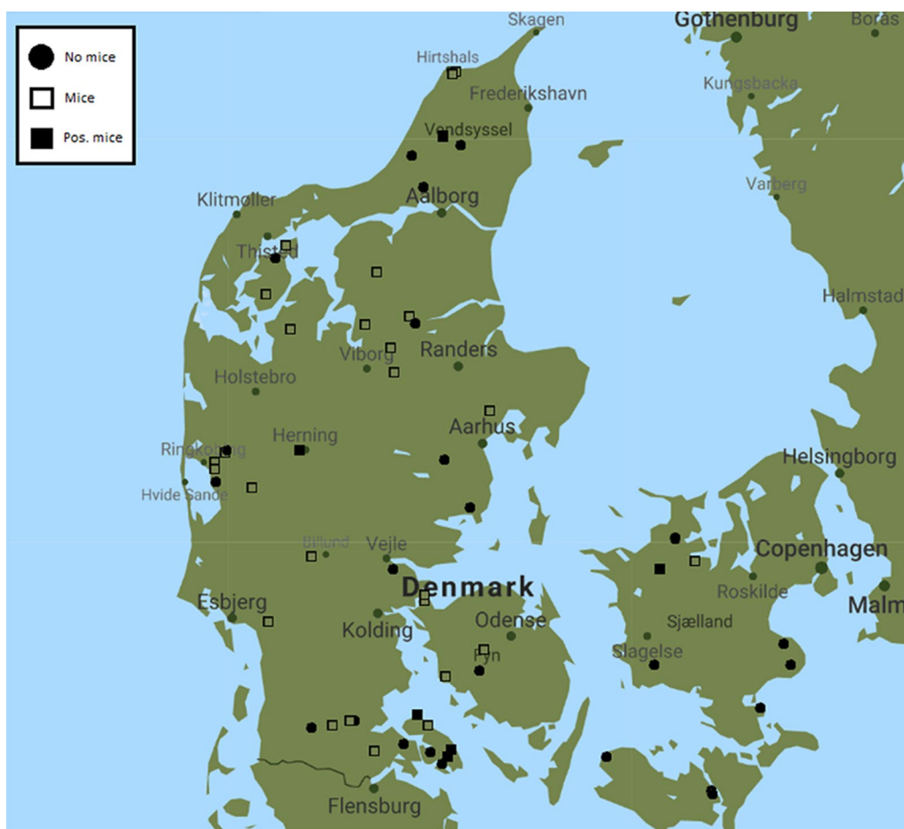
Fig. 1 Map of Denmark showing the location of the farms and status of the mice caught on them

snap traps were installed, of which eight traps were inside the pigsty and eight were outside the pigsty, i.e. in open storage spaces or along the outer walls of the pigsty. The traps were left overnight and collected the next day, using raisins and peanut butter as bait. In three cases, the traps were left for two nights, to comply with visitor quarantine rules. The mice were weighed, measured and characterised to determine the species. The brain from each mouse was sampled and immediately stored in a freezer box until return to the laboratory after which it was stored at -20^{\circ}\text{C} until further analysis. From cats belonging to the farms and having indoor access, faecal samples were collected. In cases where the cats did not defecate during the visit, faecal samples were collected from the floor or from existing litter boxes. The questionnaire was designed to gather information about the daily routines on the farm, pig management, feed storage, biosecurity and presence and management of cats and mice. The questions were created partly based on the standardised online biosecurity questionnaire [14] (BioCheck.ugent ^{\text{®}} Pig, 2018). As