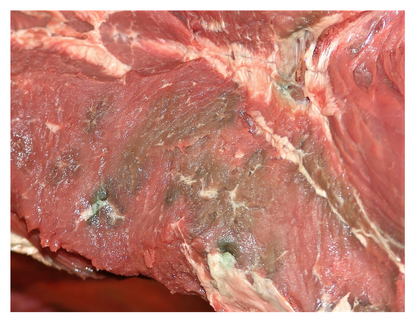
Fig. 2 Incision through thigh muscle in a case of meat spoilage in an adult male moose (Sample No. 4 in Table 4). A mottled greenish discolouration is visible, apparently following blood vessels and intermuscular connective tissue