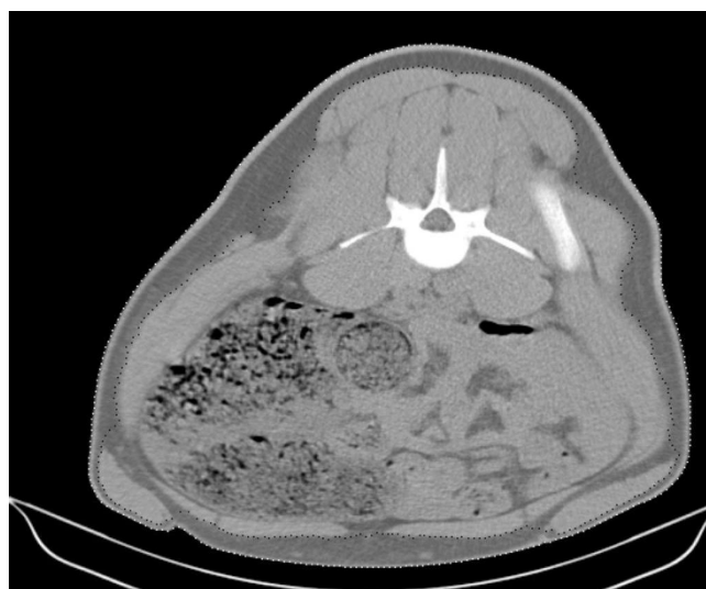
Figure 1 Computer tomography image. Transverse CT image showing the automatically determined boundaries. The outer limits of the skin are marked with white dots; the inner margin of subcutaneous adipose tissue is marked with black dots. Note in this particular image the algorithm misrepresents the desired boundaries in places because it was interrupted by discontinuities within the adipose tissue.

The average thickness measurements from all pigs at the final scan session and the average correlation between thickness at each measure point and total mantle volume for the final scan session is illustrated in Figure 2. This figure demonstrates the strength of the currently used P2 site, which is situated at slice 39 in a region of high correlation with fat mantle volume. Figure 3 shows the average