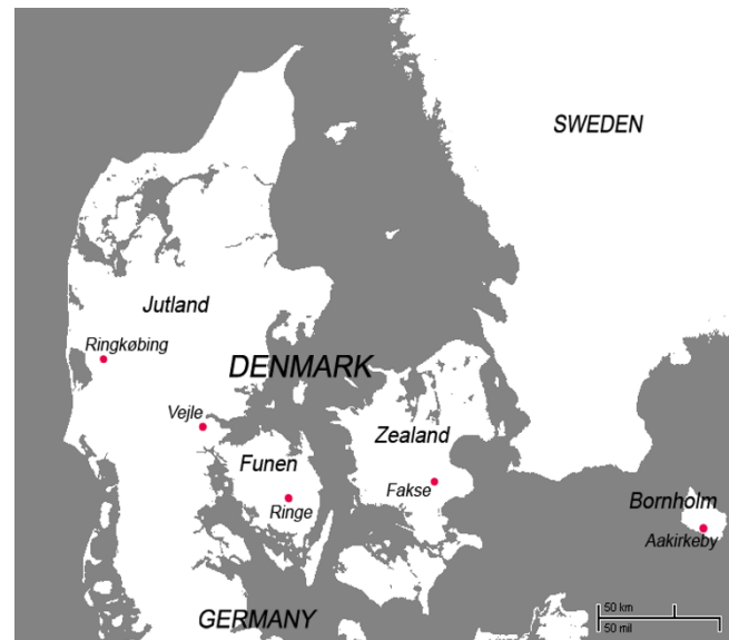
Figure 1 Geographic distribution of the five veterinary clinics in Denmark that provided canine blood samples.

The investigation was designed as a cross-sectional study, where dogs were used as sentinel animals and screened for presence of antibodies against TBEV. The study population consisted of clinically healthy dogs. Animals were recruited from five veterinary clinics from different regions of Denmark (Figure 1). Only dogs over the age of 4 years, and weighing more than 15 kg, were included because dogs of this age and size were more likely to have