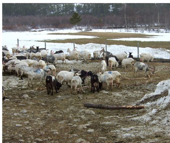
Figure 2 The goats in the outside enclosure.

two days, but now the enrichment was removed. Providing enrichment for nearly three weeks was done in order to investigate the long term effect of enrichment.