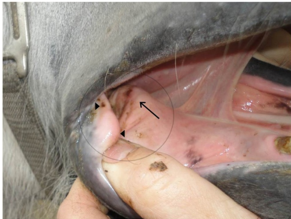
Figure 2 A pressure lesion overlies a prominent thickening of the bar of the mandible, the thickening indicating severe periostitis. Adjacent is a thickening of the buccal mucosa with a pressure lesion in close proximity to the corner of the mouth. Arrow: Prominent thickening of the bar with a pressure lesion. Arrowheads: Thickening of the mucosa with lesions.

two types of curb bits and use of the German noseband was restricted to snaffle bits, therefore, only the type of bit could be assessed as a risk factor.