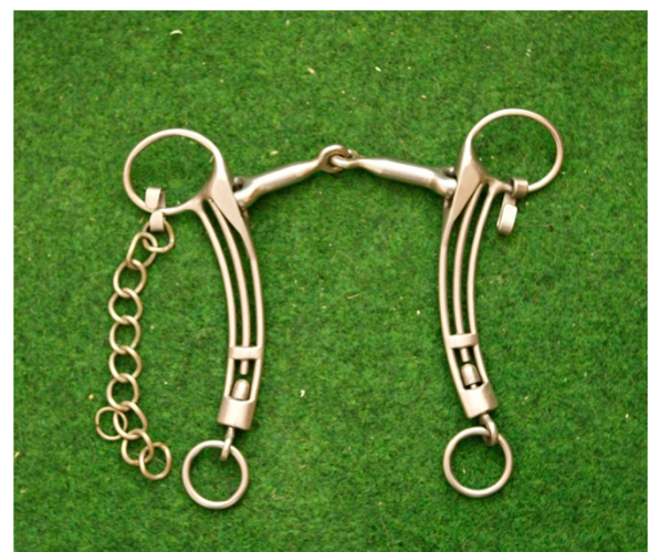
Figure 5 Traditional Icelandic curb bit without a port single jointed.

For assessment of potential risk factors binominal outcome variables (lesions vs no lesions) were used. Generalized estimating equation (GEE), developed by Liang & Zeger, was applied [11] for analysis of repeated measurements of 77 horses, where the variable 'examination' was the only fixed factor. Separate analyses were performed for lesions in the buccal and bar regions. The Proc Genmod procedure in the statistical package SAS (version 6.12) [10] was used. The link-function in Proc Genmod was specified as logistic as binominal outcome variables for lesions in the buccal and the bar regions of the mouth were used. Multivariable logistic regression was used to estimate the association between disciplines, bits and number of performances and the binomial dependent variables.