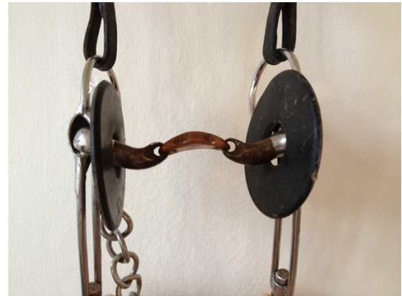
Figure 4 Curb bit with a port, double jointed.

significantly between different disciplines in the preliminary rounds, \chi^2 tests with four degrees of freedom (df) were performed with the Proc Freq procedure [10].